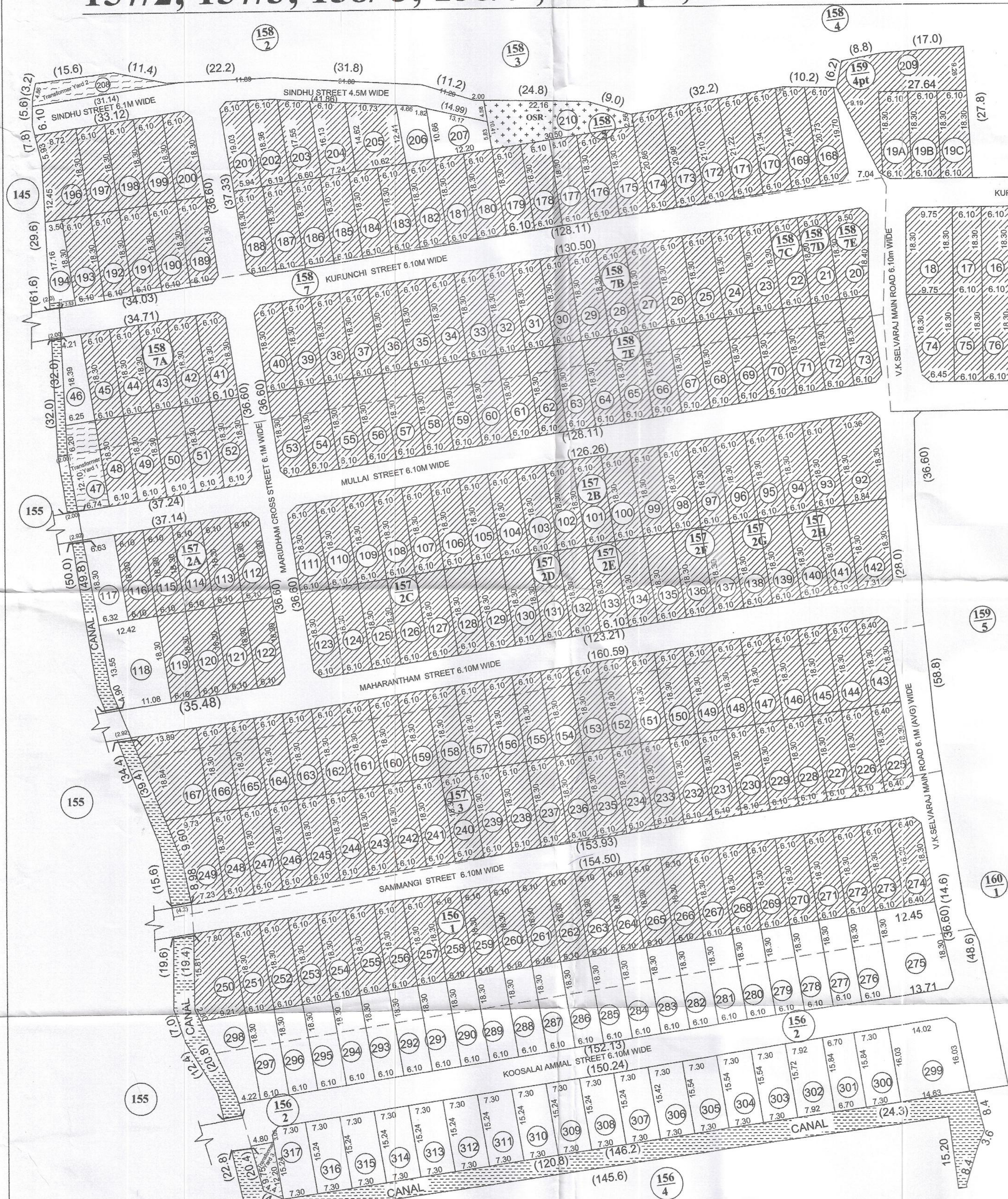
LAYOUT PLAN (Scale 1:50)