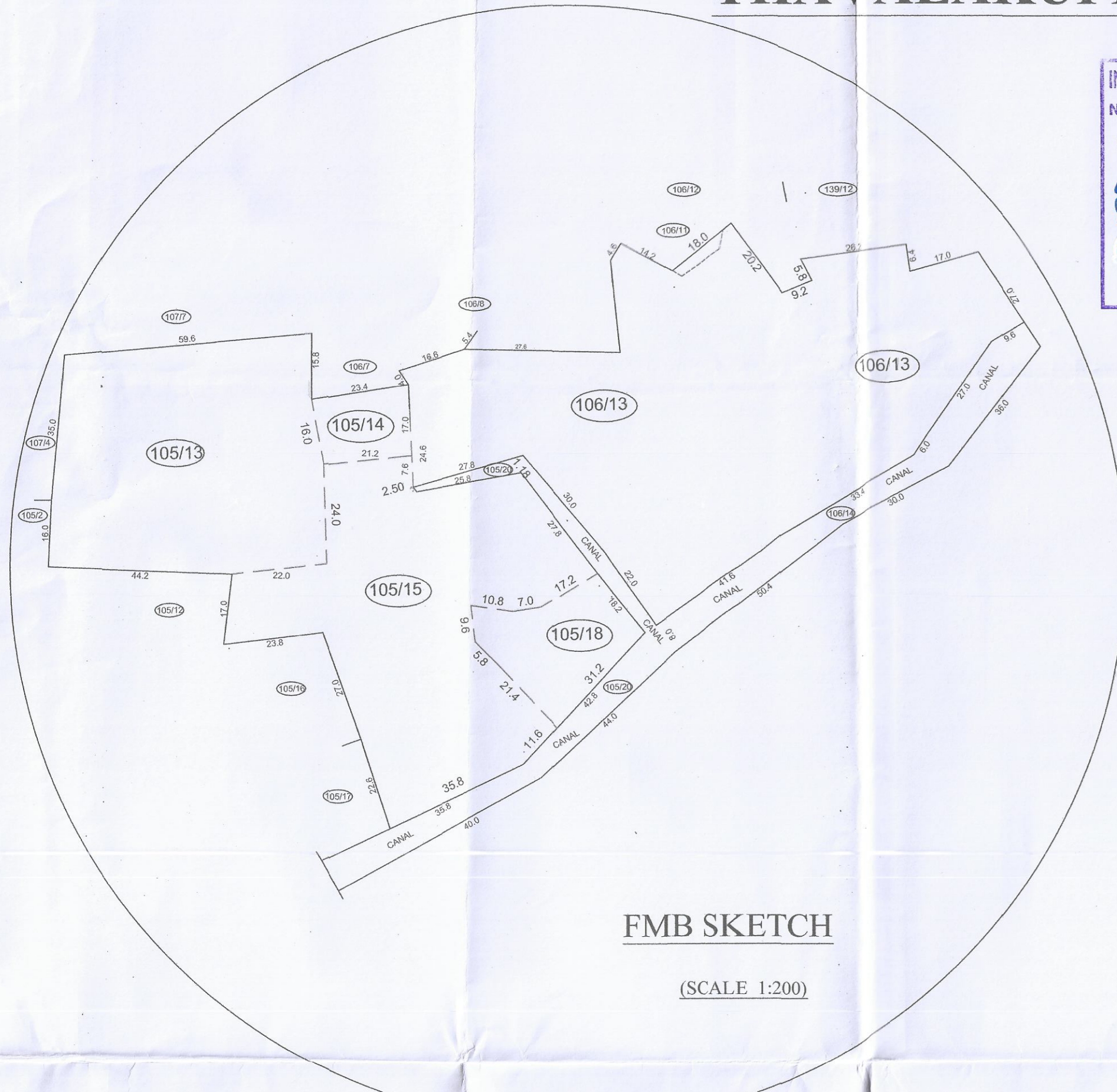
FMB SKETCH (SCALE 1:200)

IN-PRINCIPLE LAYOUT FRAME WORK APPROVAL ISSUED VIDE NO. 145 / 1327 / P.P.A. / 2020 (ACCEPTED) 8 JAN 2021 Layout / IP-APP / 2020 05/01/2021 MEMBER SECRETARY PUDUCHERRY PLANNING AUTHORITY *Subject to the fulfilment of conditions Stipulated in the permit (Sl. No.1 to 2)